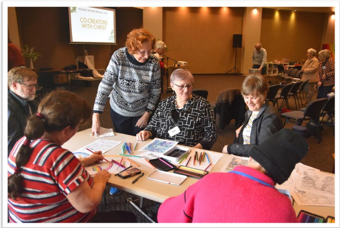
Sharing and amplifying ideas at the Winter Retreat

We have a continuing agenda to inform potential members of Pilgrim Uniting Church through information packs and Open Church; and consideration of how the church can be flexible to both support families with young children, and those members who are aging and less mobile.