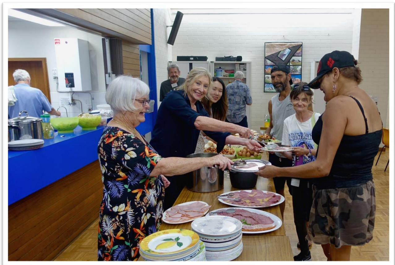
Just one of the 7 teams who prepare and serve meals on Sunday nights in the Pilgrim Centre