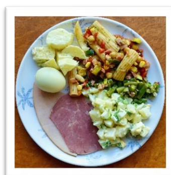
Tasty and nutritious food is offered each Sunday night

We were pleased to welcome the Minister for Human Services, the Honourable Nat Cook, in April to observe SNT in action – but she insisted on serving to the delight of the volunteer team and guests.